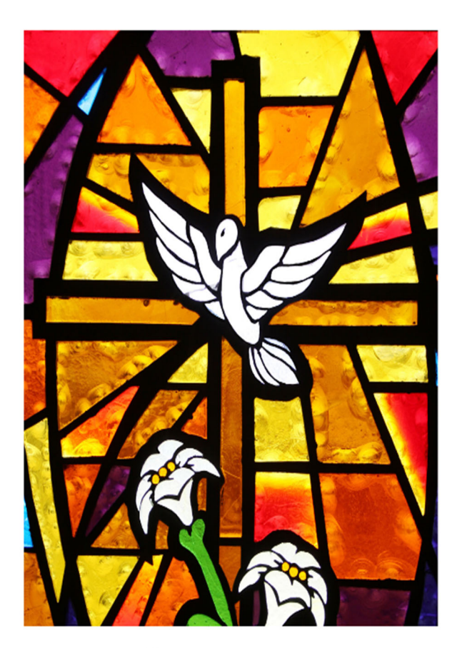
Pentecost 2024 Come, Holy Spirit, Come!